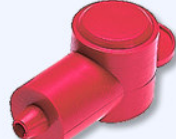
218 Series 18 mm TOD 18 - 2 ga cable