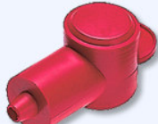
216 Series 16 mm TOD 18 - 2 ga cable