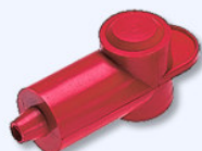
212 Series 12 mm TOD 18 - 2 ga cable