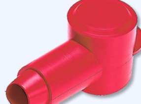
234 Series 34 mm TOD 18 - 4/0 ga cable