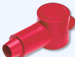
228 Series 28 mm TOD 18 - 2/0 ga cable

The 200 Series is commonly used on inverters, starters, windlasses, chargers, and other high energy connections.