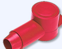
226 Series 26 mm TOD 18 - 2/0 ga cable