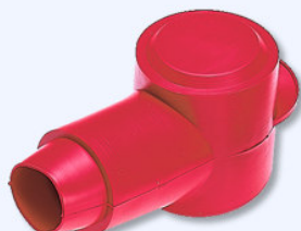
232 Series 32 mm TOD 18 - 4/0 ga cable