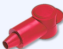
220 Series 20 mm TOD 18 - 2/0 ga cable